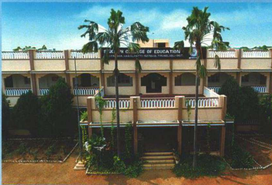
ST. JOSEPH COLLEGE OF EDUCATION