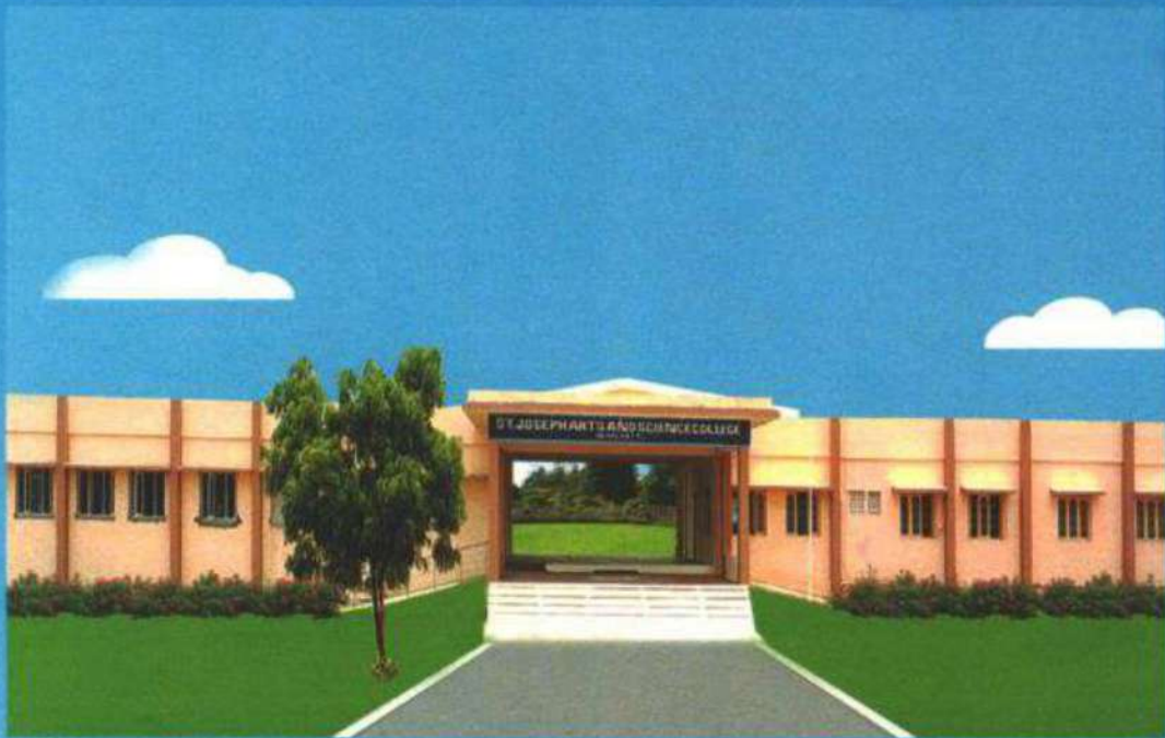
ST. JOSEPH COLLEGE OF ARTS AND SCIENCE